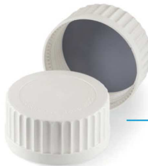
DURAN® PURE GLS 80® Screw Cap made from PSU with PTFE coated silicone seal