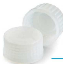
DURAN® PURE Premium Lip Seal Cap GL 45 made from PFA