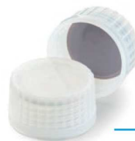
DURAN® PURE Premium Screw Caps GL 25 and GL 45 made from PFA with PTFE coated silicone seal